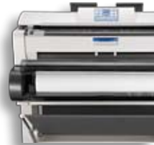
Front System Access